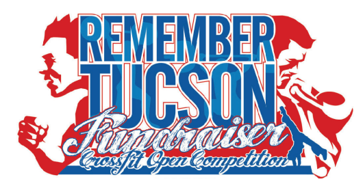
Saturday, January 11th, 2014 CrossFit Now, Tucson

For the fourth year, CrossFit Now and CrossFit Purgatory have joined forces to bring you an amazing CrossFit competition. This event will help raise money for the Arizona Homicide Survivors Fund in honor of the victims of the January 8th 2011 Shootings.