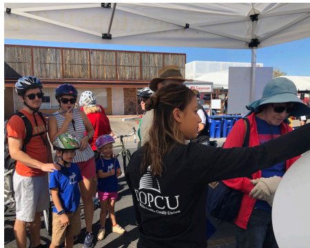
We had a great time at Cyclovia Tucson. If you haven't attended before, there is always next year! We will continue to show our support to great Tucson community events.