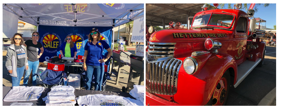
TOPCU staff and the crew from Southern Arizona Law Enforcement Foundation(SALEF) lend helping hands at Cops and Rodders event in November.